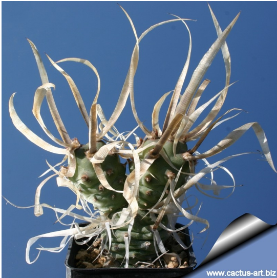
Tephrocactus articulatus v. papyracanthus

All cuttings root easily. Seed propagation requires patience, with seed scarification and sometimes artificial wintering. Propagation of all Tephrocactus is most easily accomplished by cuttings or from the joints that comprise the plant by keeping the seed damp and cold in the refrigerator required. Seed germination can be erratic, with seeds from the same plant sometimes germinating in days, and sometimes not for months.