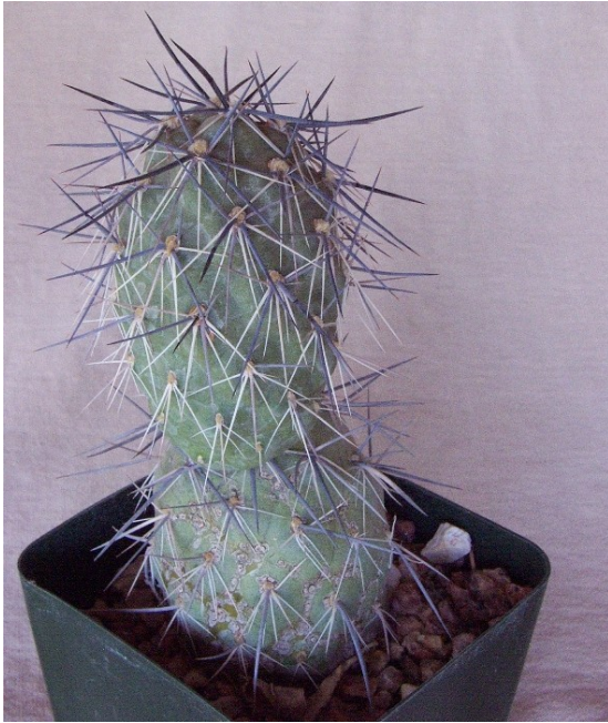
Tephrocactus alexanderi v. alexanderi

The Cactus family is divided into a number of subfamilies. The Opuntioideae is one of these subfamilies. The Opuntioideae covers the largest geographical range of any of the sub-families, stretching from Southern Argentina to Canada, and covers all of the Caribbean islands and Pacific Islands from the Galapagos to the Catalinas. It is naturalized on every continent except Antarctica. It is a pest and a noxious weed in many places, and is displacing native vegetation in parts of Africa, Madagascar and Australia.