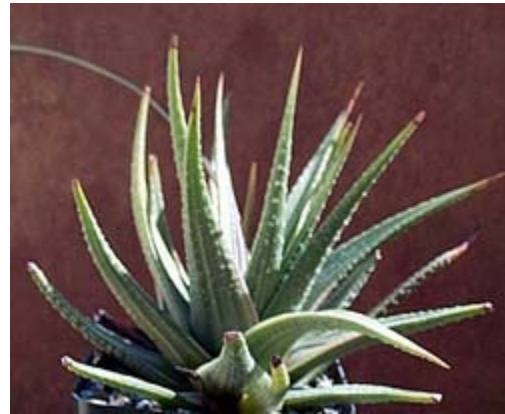
Haworthia attenuata x pumilla variegata

Euphorbia - A number of columnar variegates are available, E. ammak , being the one most often seen. There are also some cristate and monstrose variegates as well.