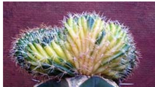
Variegated Monstrose Lobivia

Many of these are artificially propagated by grafts. The famous 'Red Caps' and 'Yellow Caps' are Gymnocalycium or Lobivia variegates that have no chlorophyll at all, and live only by being grafted onto a root stock.