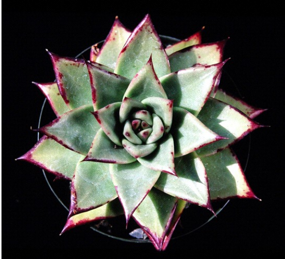
Echeveria agavoides cv 'Ebony'

Echeveria is one of the principal members of the succulent New World Crassulaceae . Echeveria come principally from the mountains of Eastern Mexico, although there are plants found from Texas into South America.