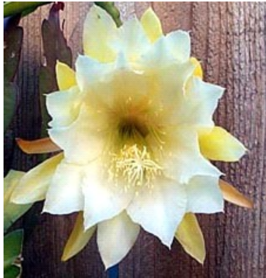
Epiphyllum 'Lemon Custard'

diately. Thicker leafed genera should be allowed to dry for a day or two before planting. Zygocactus can be easily propagated from cuttings, but for reasonable success, two segments need to be used rather than one.