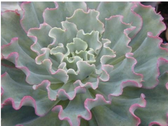
Echeveria 'Blue Curls'